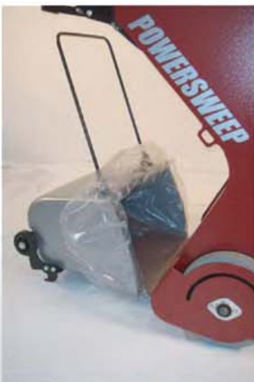
Large Capacity Debris Hopper