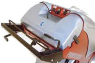
Simple Easy To Use Controls