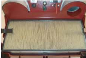
Large Hopper Filtration for dust