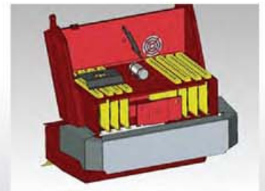
Automatic Filter Cleaning System

The PowerSweep PS170 is a Heavy-Duty industrial grade machine that features a state-of-the-art high-efficiency dust filtration system. The high-efficiency filtration system combined with the units wide 170 cm sweeping path provides maximum productivity and efficiency in the one pass, leaving the floor clean and surrounding environment free of airborne machine dust.