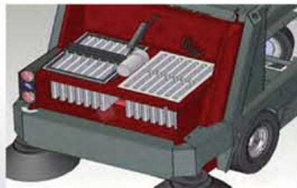
Patented High-Efficiency Filtration