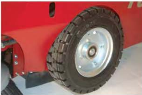
High Ground Clearance