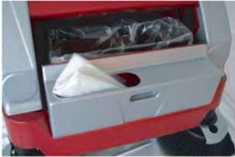
"BDS" Bag Dump System Option