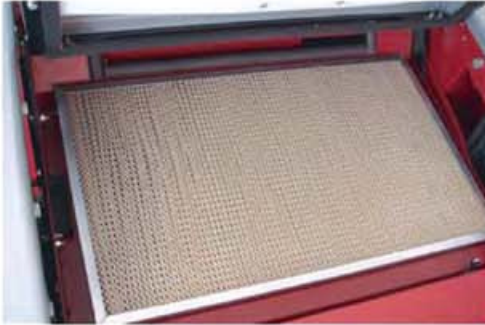
Large High Efficiency Dust Filtration