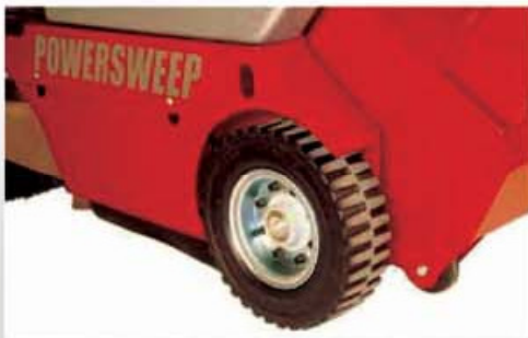
High Ground Clearance