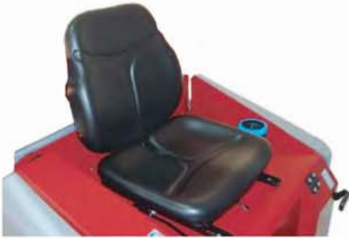
Comfortable Operator Console